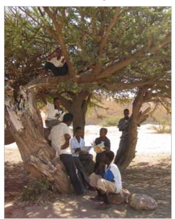
A secondary student from Abaarso Tech reads BFA books to Abaarso Village students. The coursework in all classes at Abaarso Tech is structured around BFA textbooks.

Lastly, they gave some BFA books to a women's organization and a school in nearby Abaarso Village, a small, rural community with no resources, no water, no medical care, no electricity, and little education. Students from Abaarso Tech teach English and math to primary students in the village every day, and use BFA books in these classes on a regular basis.