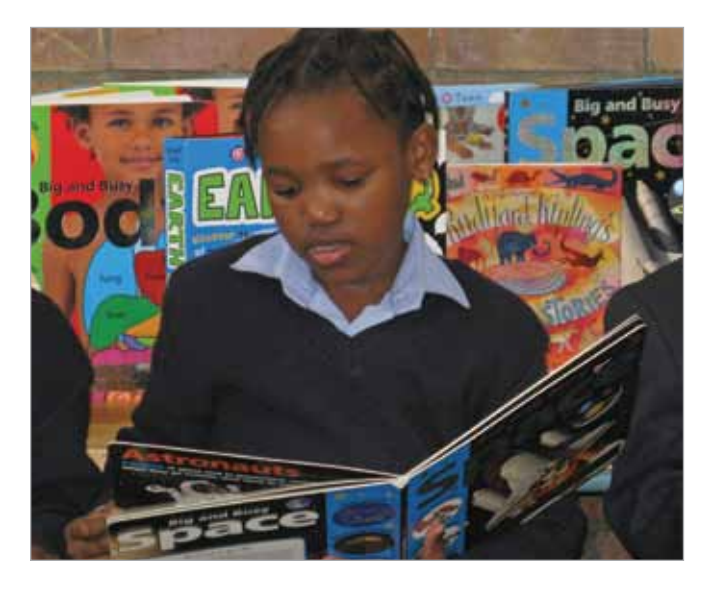
Above: A student at Shine Centre in Cape Town reads a BFA book provided thanks to funding from Donaldson Company.

Left: A student at Shine Centre peruses all the new BFA books.