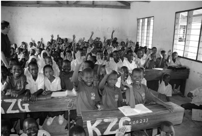
Greetings from students near Dar es Salaam, Tanzania