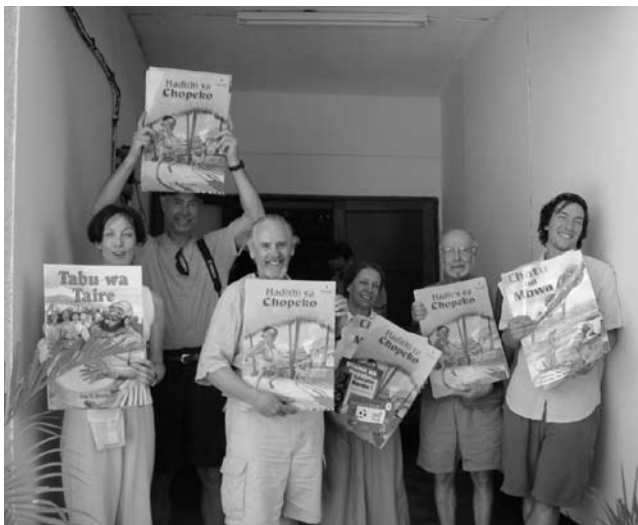
The BFA delegation to Tanzania visited the Children's Book Project in Dar es Salaam, Tanzania, which publishes books in Kiswahili. Books For Africa presented a grant to assist in defraying the costs of printing books in this local language.