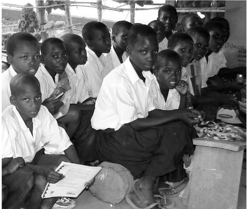
A school outside of Dar es Salaam, Tanzania.

Thank you to all BFA donors for your outstanding support. Without your support we would not be able to achieve our mission of helping the children of Africa through ending the book famine. If you have not already donated to BFA in this fiscal year, please consider a donation at this time. All donations of $50 or more received by July 1st will be recognized in the BFA annual report for 2006.