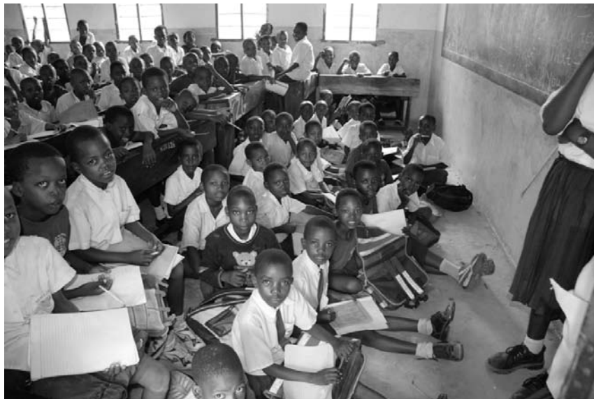
A typical classroom near Dar es Salaam