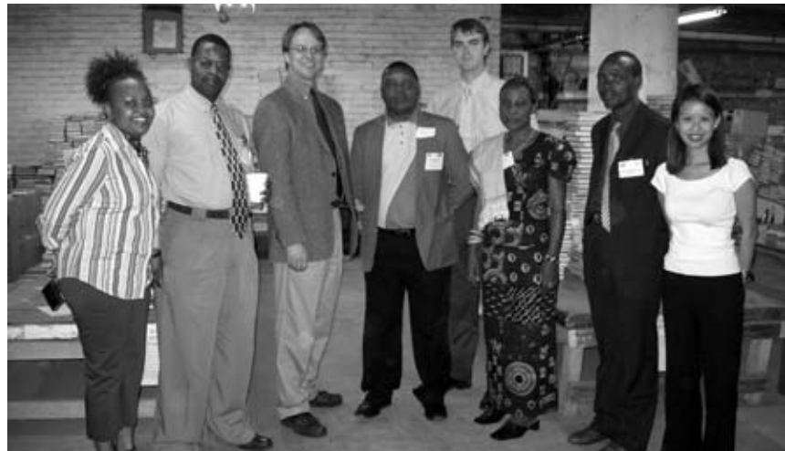
Books For Africa recently hosted a delegation from the parliament of the United Republic of Tanzania. The delegation was traveling across the United States as part of the American Council of Young Political Leaders and toured the Books For Africa warehouse when they were in Minnesota. Books For Africa has shipped approximately 950,000 books to Tanzania since 1988.