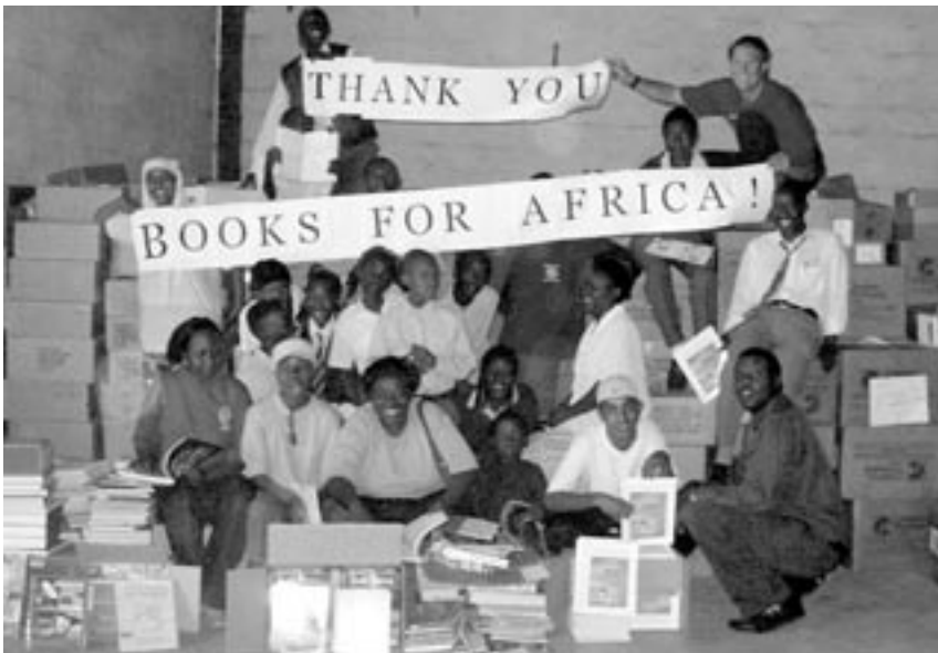
BFA's first EDDI shipment to Botswana was well-received.