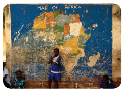
Above: Ending the Gambian book famine will be a step toward ending the book famine on the African continent.

Tom Warth and a delegation of loyal Books For Africa supporters walked the 25 kilometer (15 mile) Trans-Gambian highway in February 2012 to distribute a full container of books to the children of The Gambia. The group wanted to show that if BFA can end the book famine in one country like The Gambia, we will be one step closer to ending the African book famine.