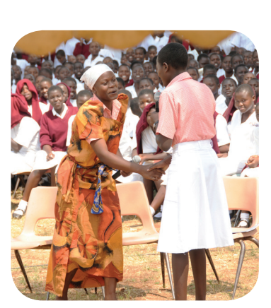
Right: Many of the students wrote and performed skits to show how education positively impacts their lives.

The library is stocked with books thanks to the Books For Africa shipment. With a good supply of books, the community is now working with donors like USAID to further upgrade the library.