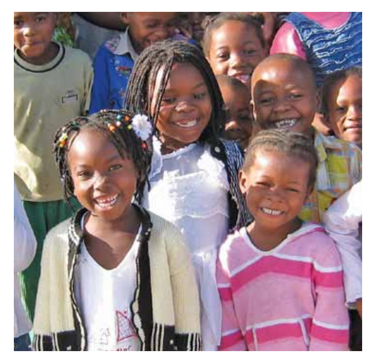
These first graders from Ray of Light School in Mozambique were happy to receive their BFA books.