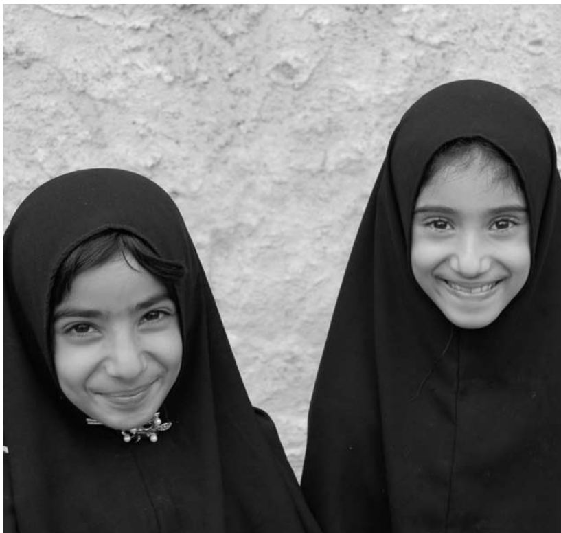
Children on Zanzibar greet a BFA delegation.