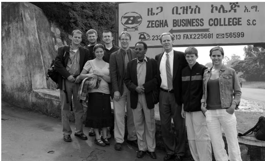
A BFA/Better World Books delegation visits Zegha Business College in Addis Ababa, Ethiopia checking on a book donation.