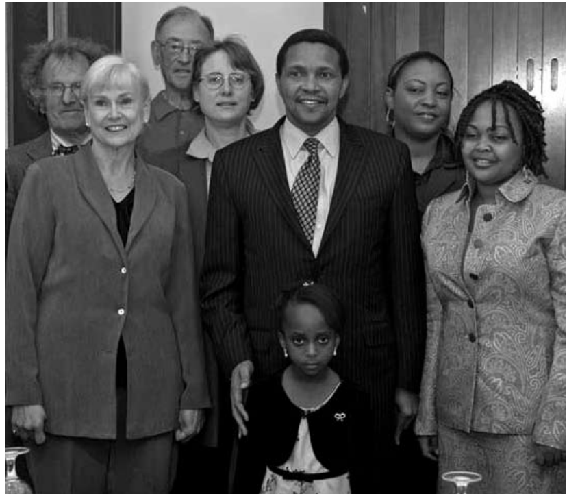
A Books For Africa delegation meets with His Excellency President Kikwete of Tanzania on September 27, 2006.

Campaign. In 2005, BFA received approximately $67,000 in pledges from United States federal employees across the world. Books For Africa is part of the Aid to Africa Federation, but carries its own CFC number (#9954) so federal employees may donate directly to BFA. The Combined Federal Campaign is the world's largest workplace-giving program, soliciting donations from nearly four million federal employees and generating approximately $250 million in donations. Books For Africa appreciates the support of federal employees in this, the 2006 Federal Combined Charities Campaign.