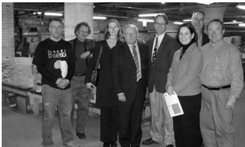
Books For Africa board members and staff recently hosted Congresswoman Betty McCollum of St. Paul, Minnesota as well as representatives of the Minnesota Trade Office, the Corporate Council on Africa, and local Rotarians at a warehouse tour. The group discussed opportunities for increased cooperation between BFA, government entities, corporations, and key non-profits such as Rotary International.