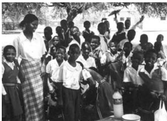
A typical school in Africa.

We run a primary school for those orphans, Sori Lakeside Junior Academy, which is a mix of day scholars and boarders. Currently we have 210 students attending the school. However, due to the high poverty level of the community, guardians are unable to pay even a small amount in