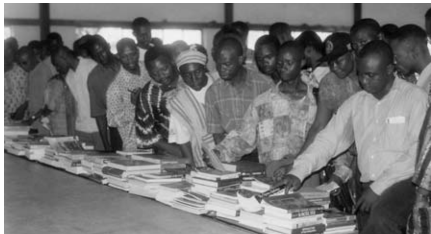
A typical BFA book distribution in Africa.

ery of books to specific areas in Africa through pooling their resources. Those interested in supporting any of the featured projects can simply go to www.booksforafrica.org and then click on the "Featured Containers" section on the left-hand side of the screen. Maybe you have a book project that you would like to have featured on the BFA website? Contact BFA offices for more information about how to get books to your project in Africa.